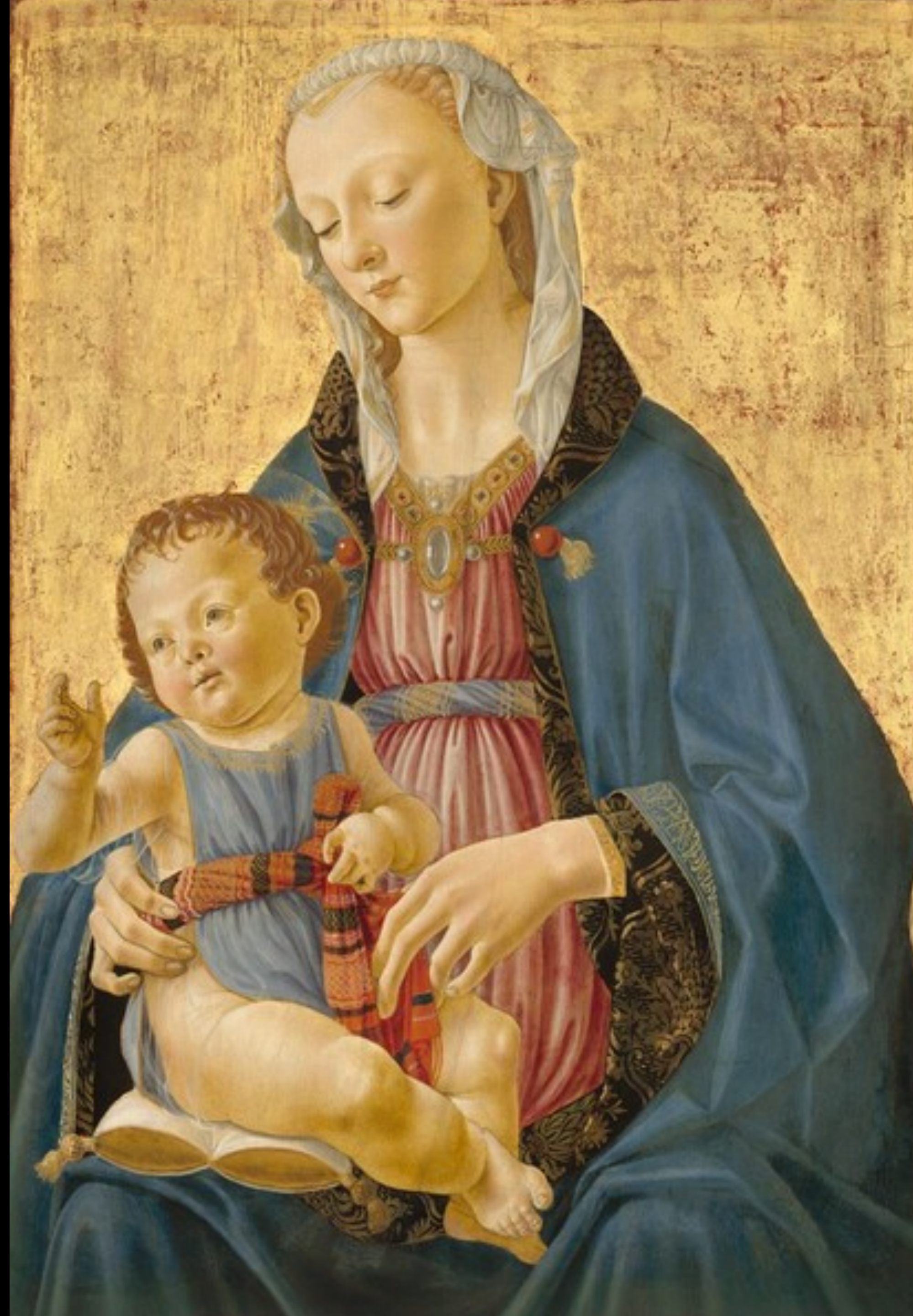
Madonna and Child by Domenico Ghirlandaio