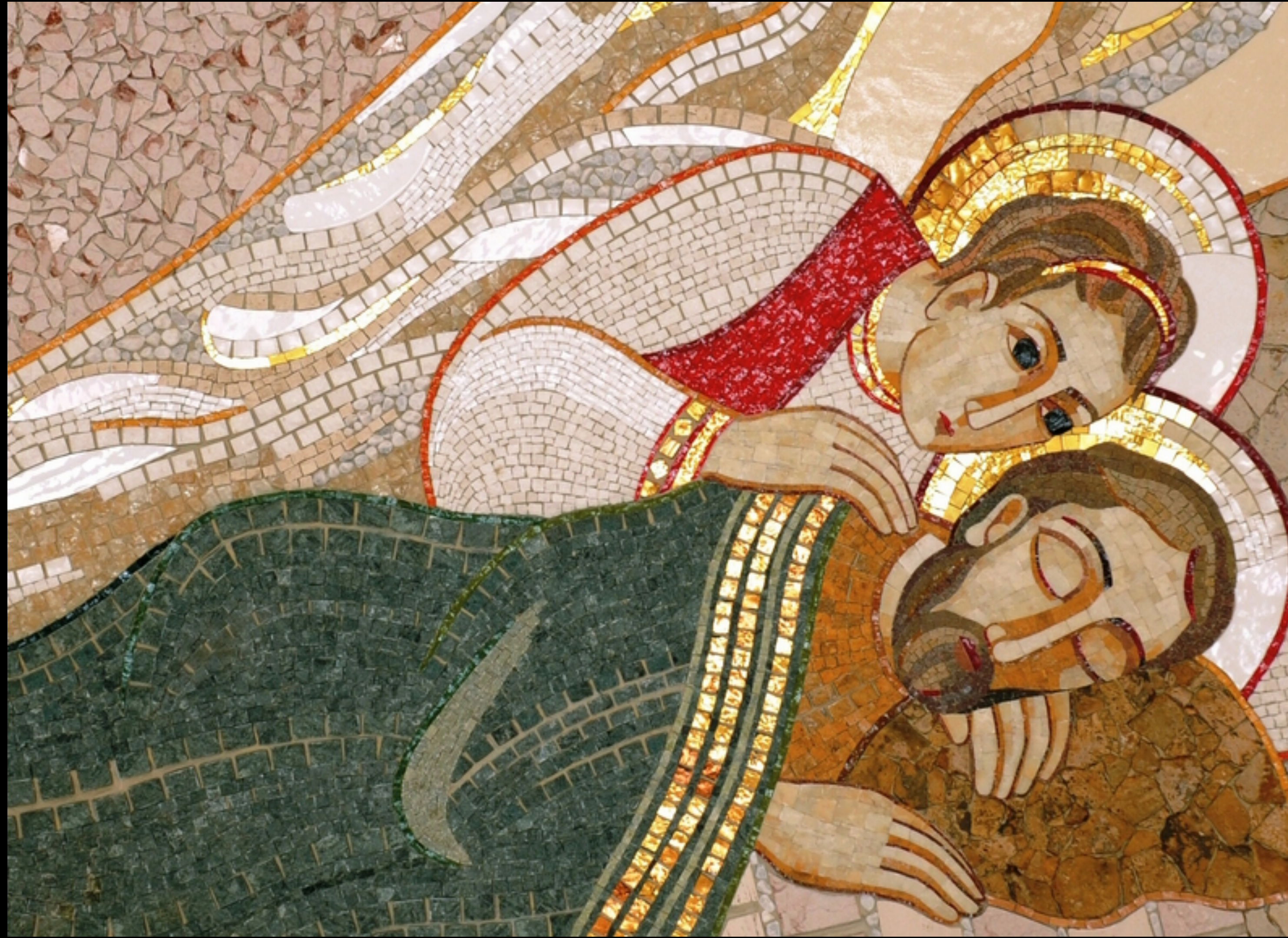
An Angel of the Lord Speaks to Joseph in a Dream