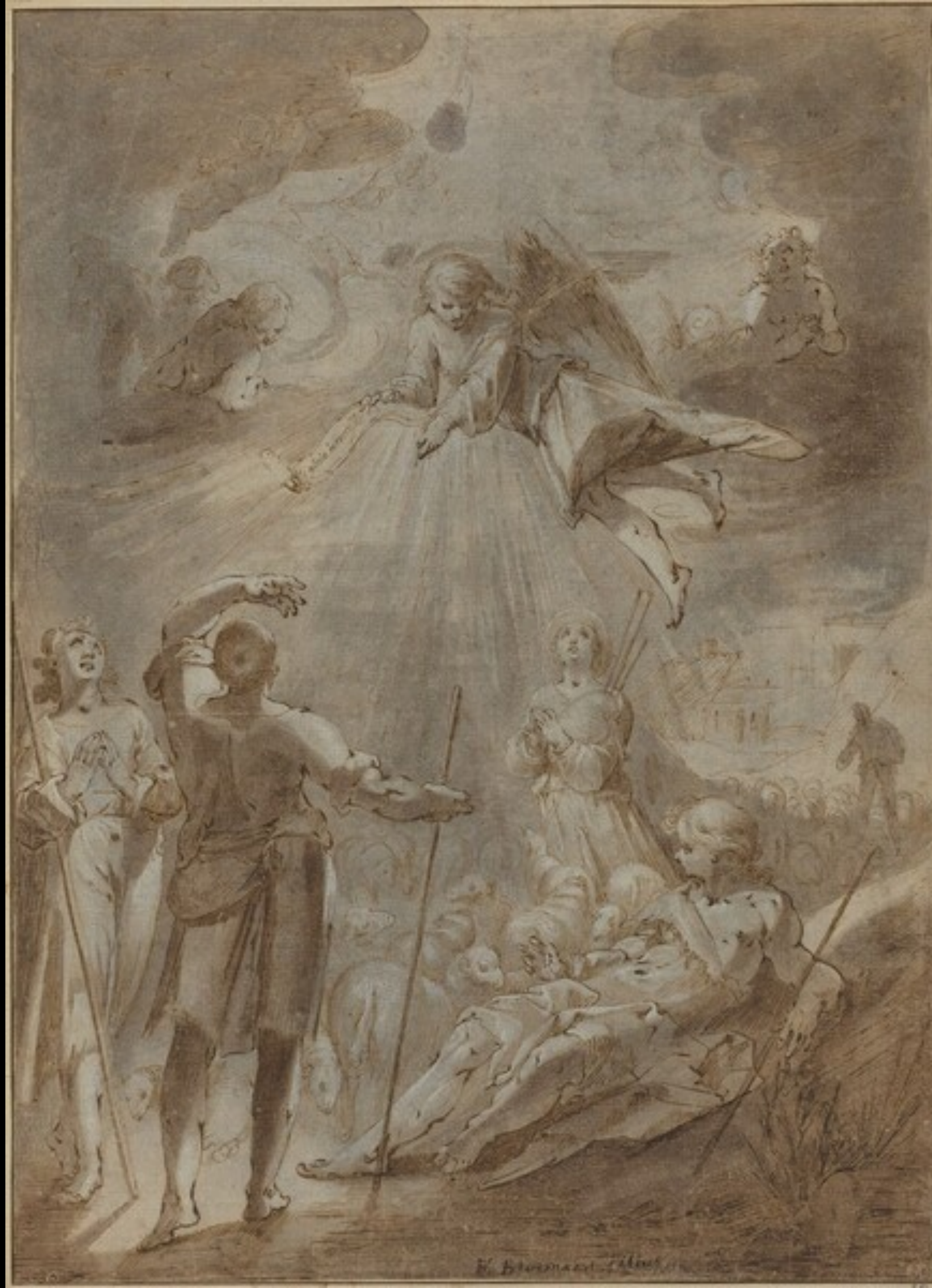
Annunciation to the Shepherds by Gerrit Pietersz Sweelinck