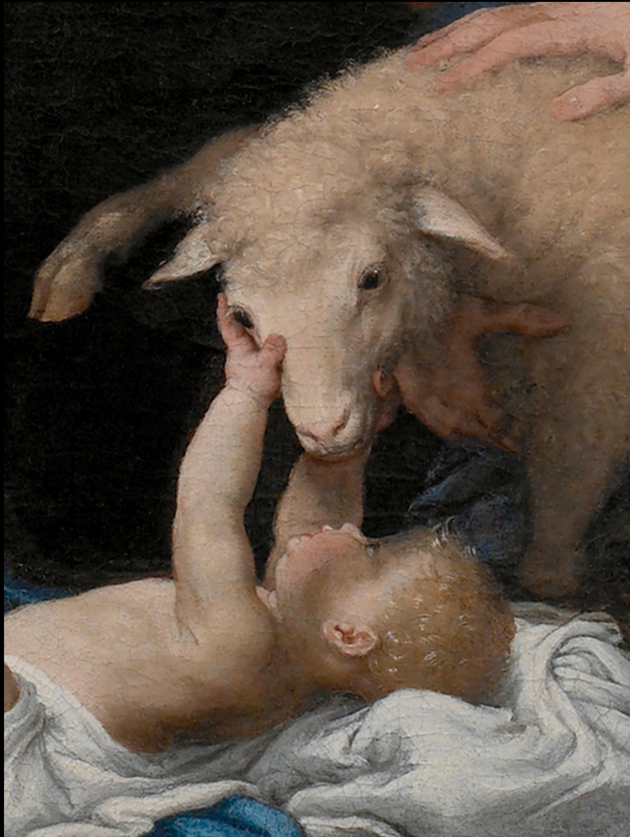
Adoration of the Shepherds (detail) by Lorenzo Lotto