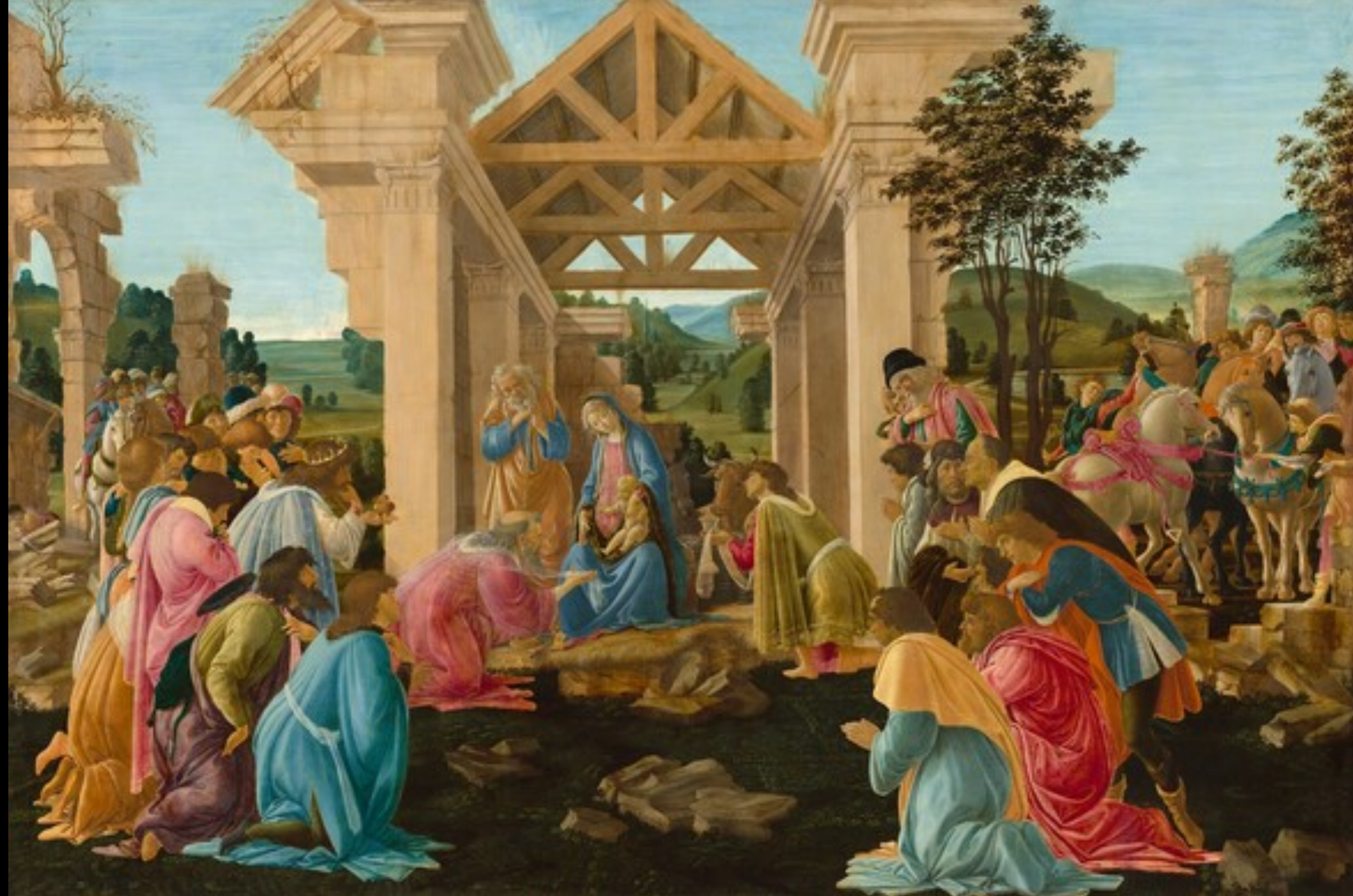
The Adoration of the Magi by Sandro Botticelli