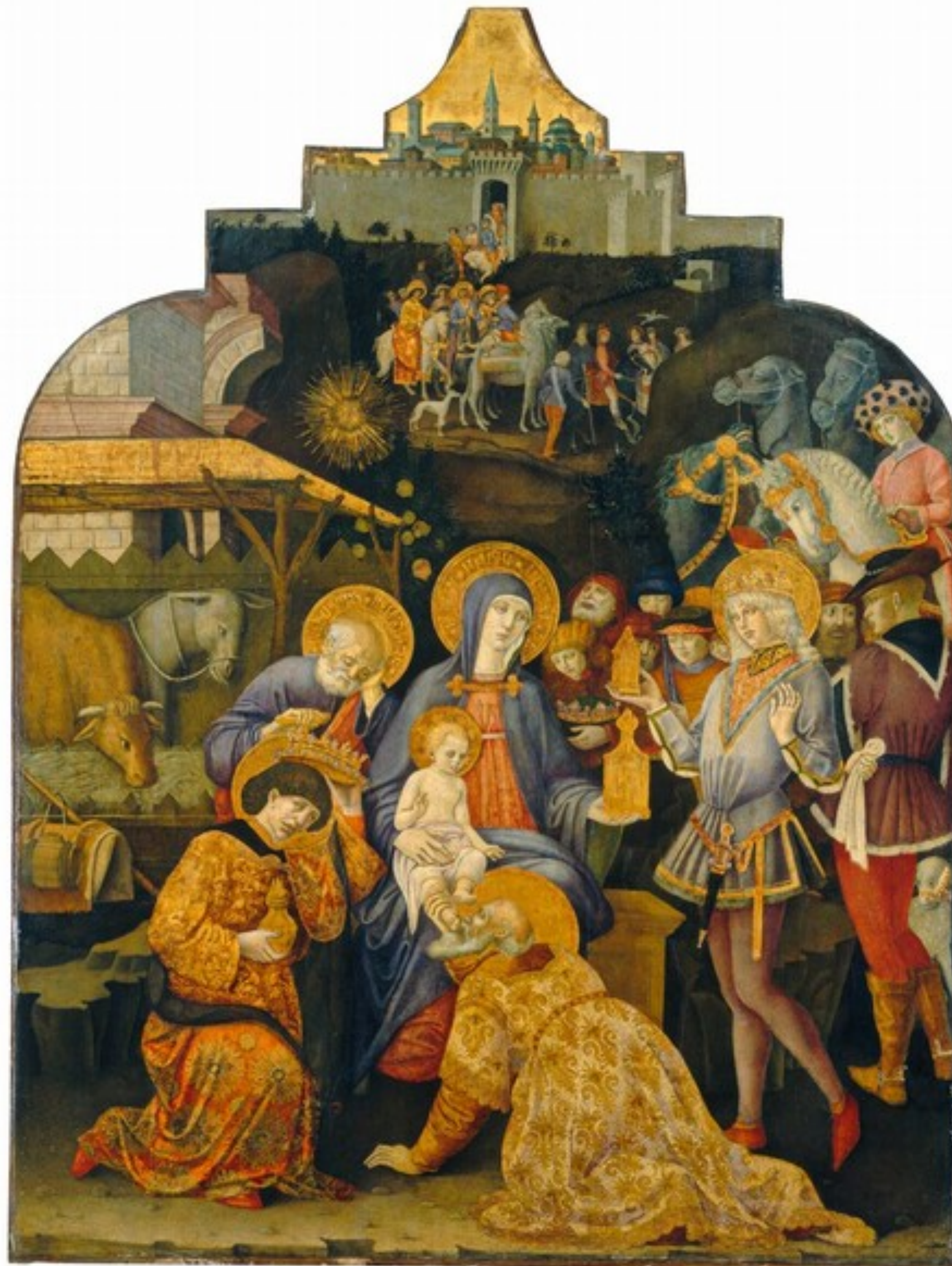
The Adoration of the Magi by Benvenuto di Giovanni