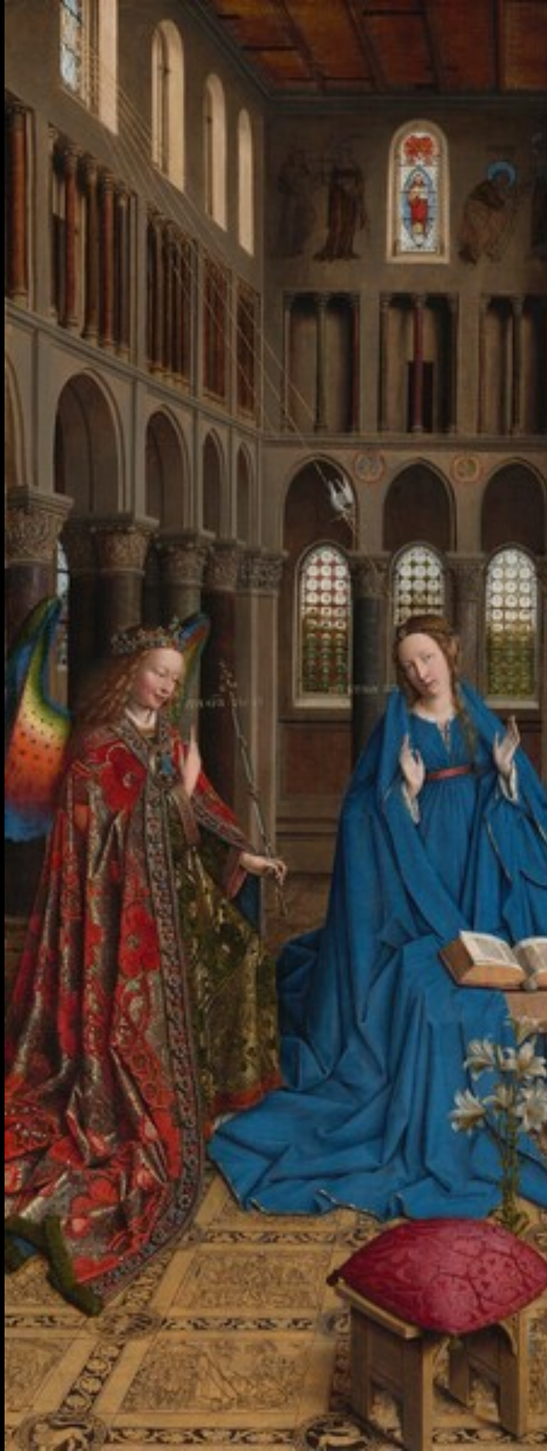
The Annunciation by Jan van Eyck