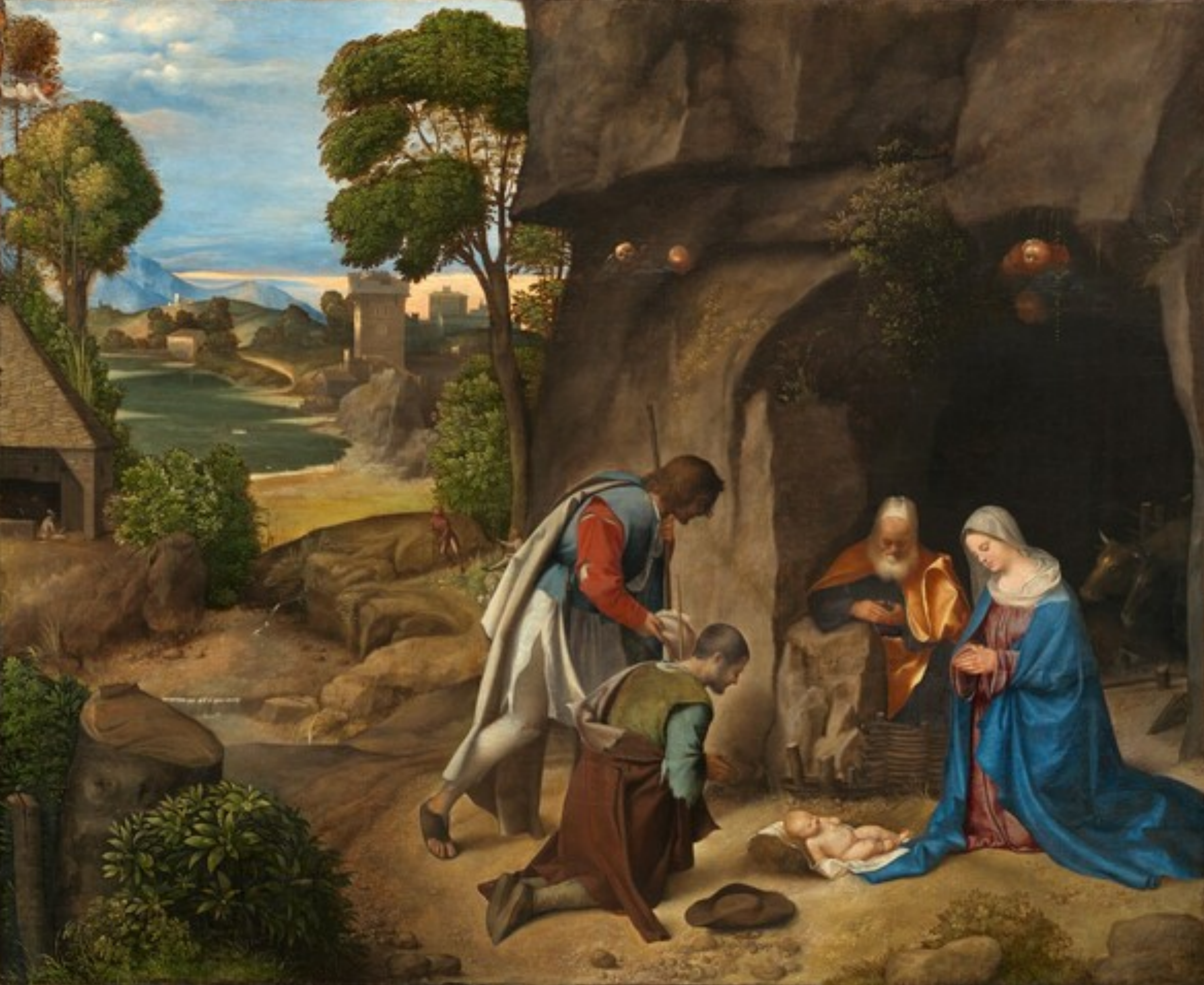
The Adoration of the Shepherds by Giorgione