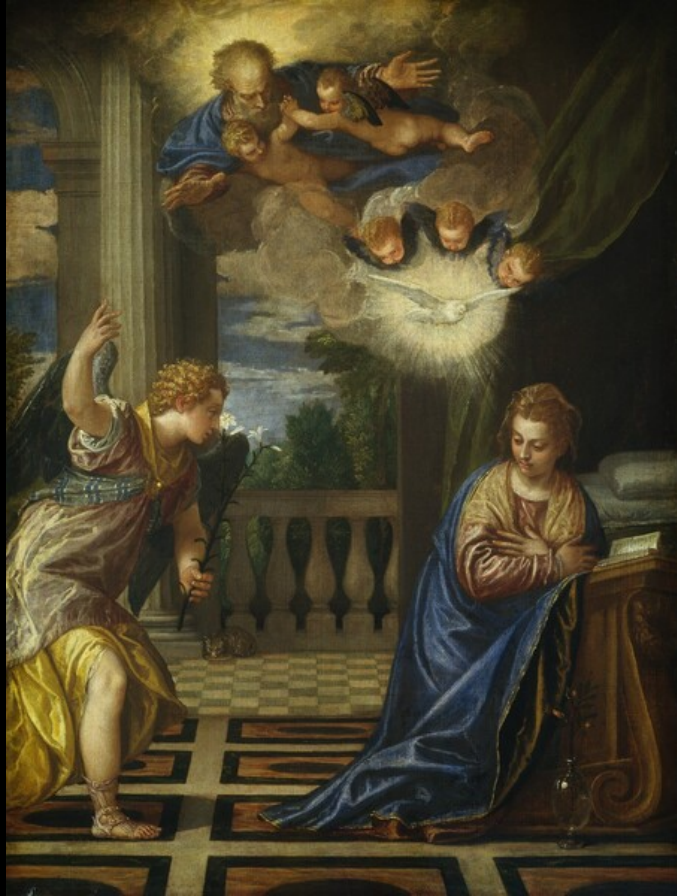
The Annunciation by Veronese