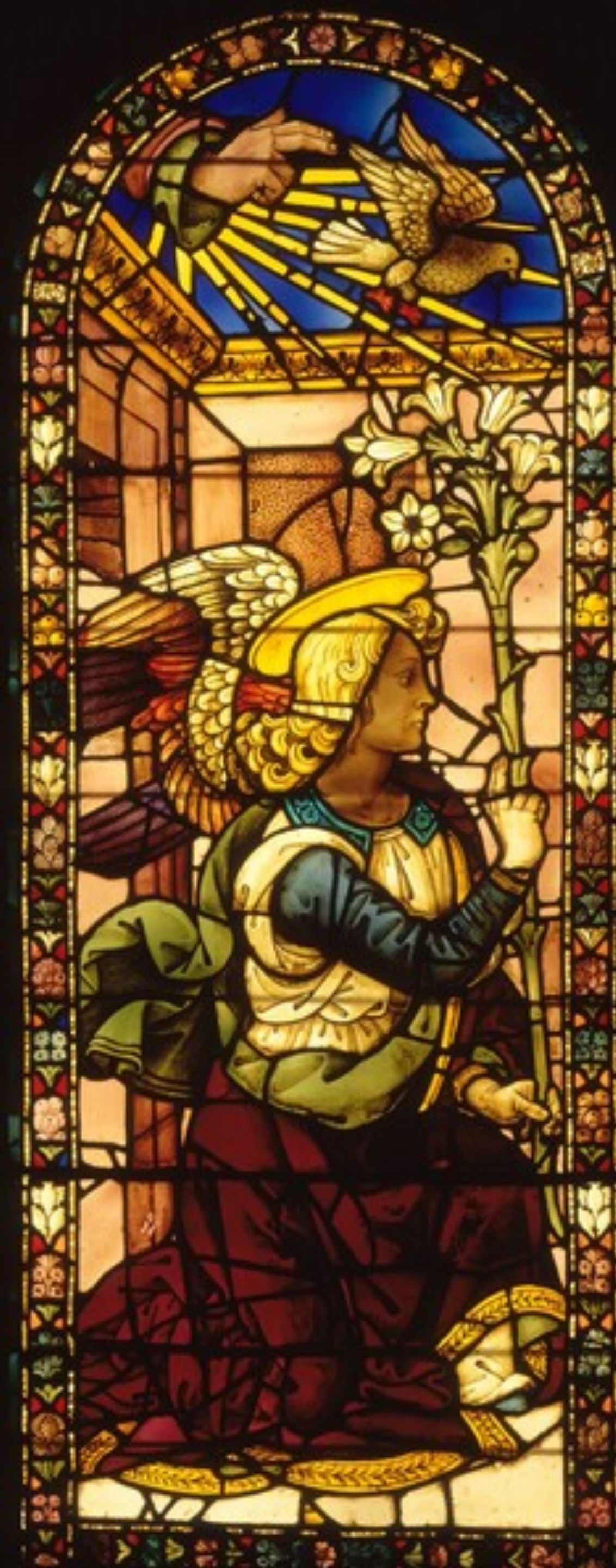
The Angel of the Annunciation by Giovanni di Domenico