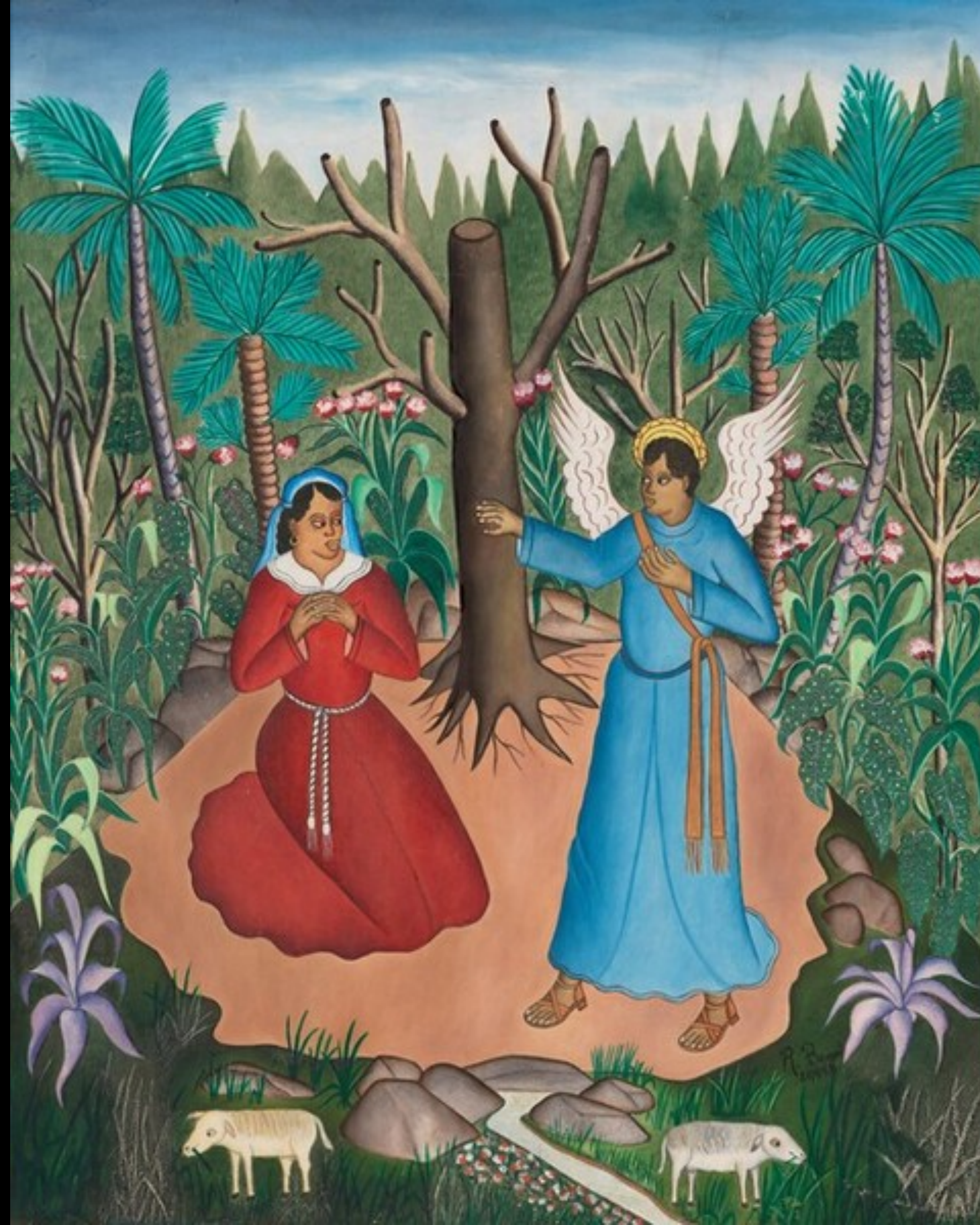
The Annunciation by Rigaud Benoit