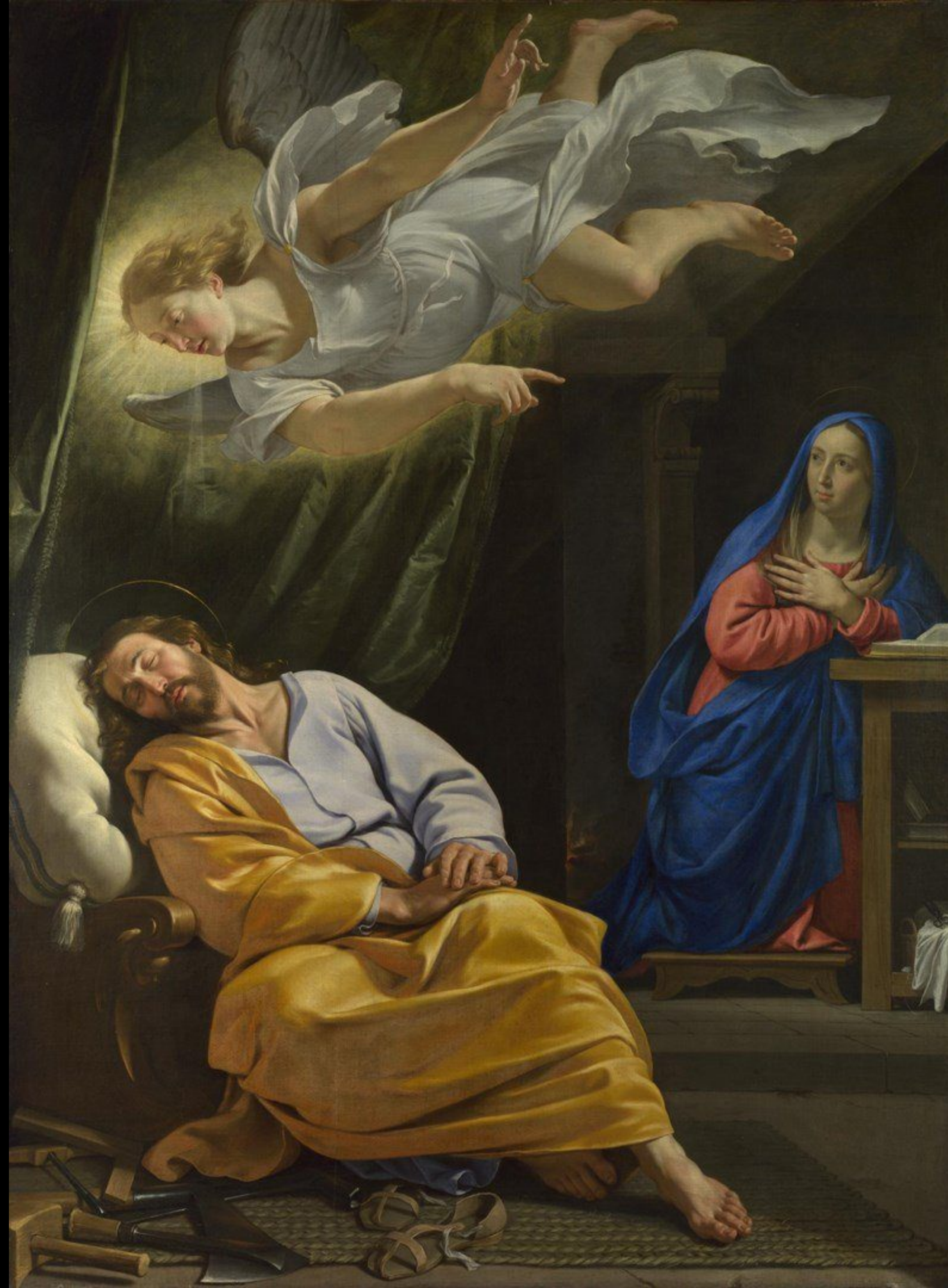
The Dream of Saint Joseph by Philippe de Champaigne