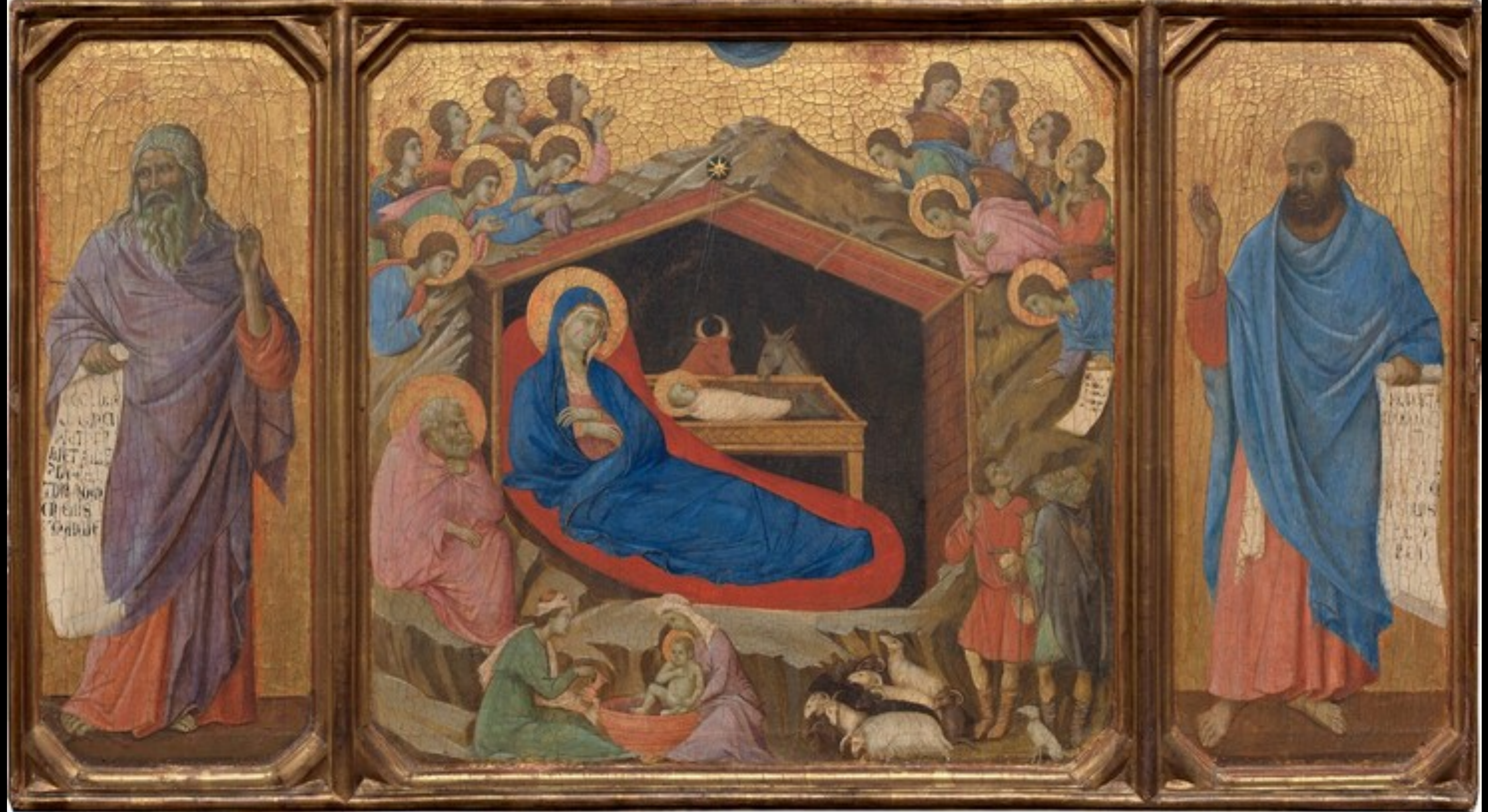
The Nativity with the Prophets Isaiah and Ezekiel by Duccio di Buoninsegna