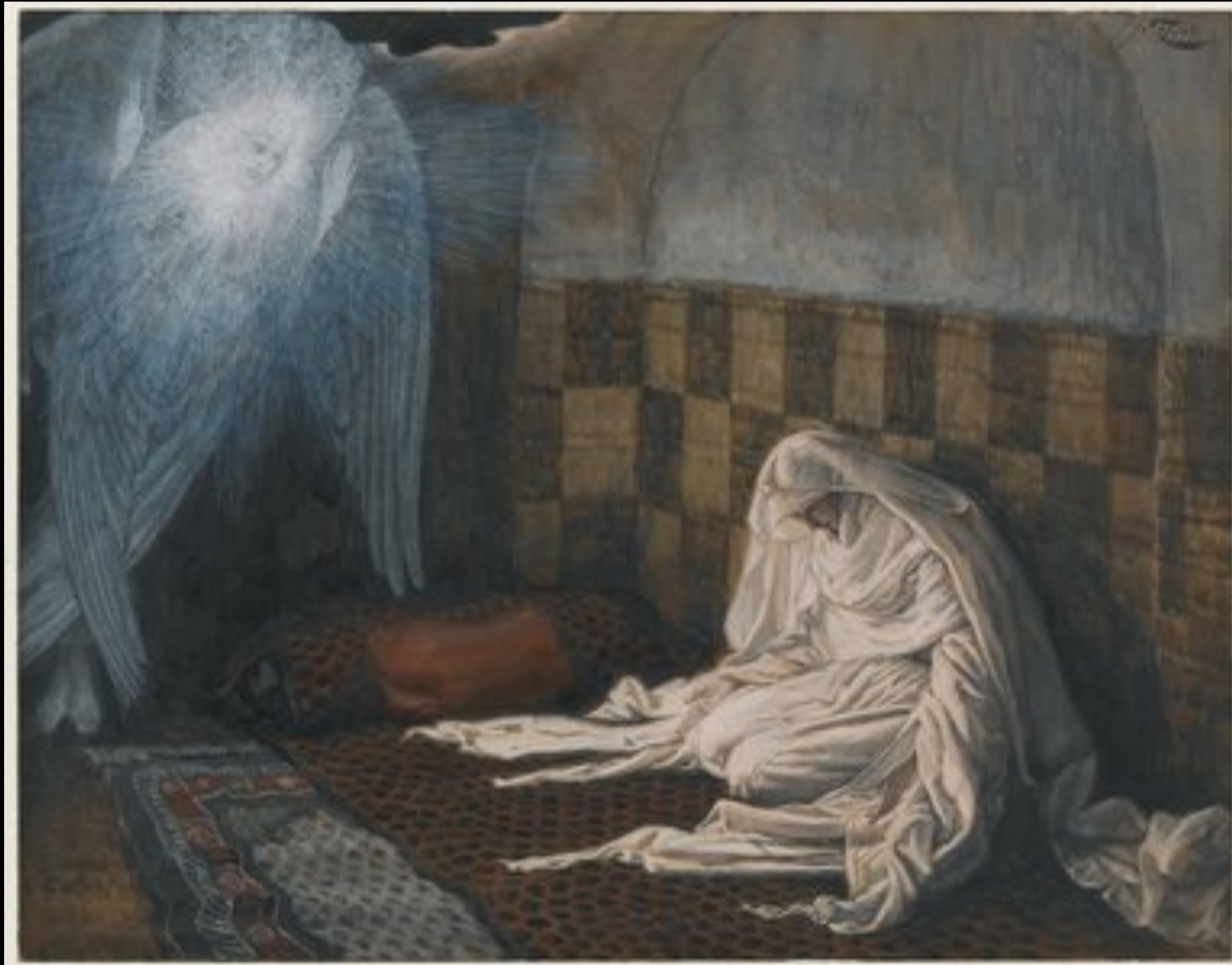
The Annunciation by James Tissot