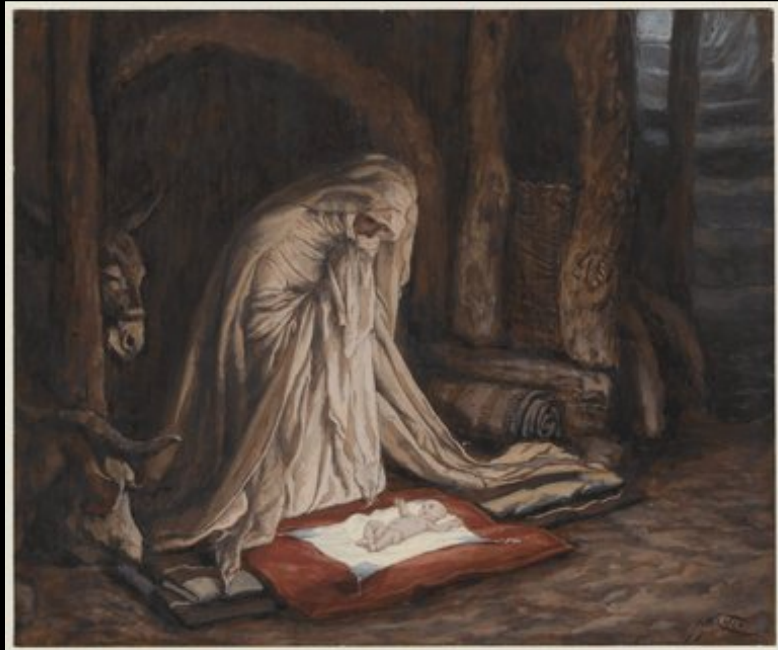
The Birth of Our Lord Jesus Christ by James Tissot