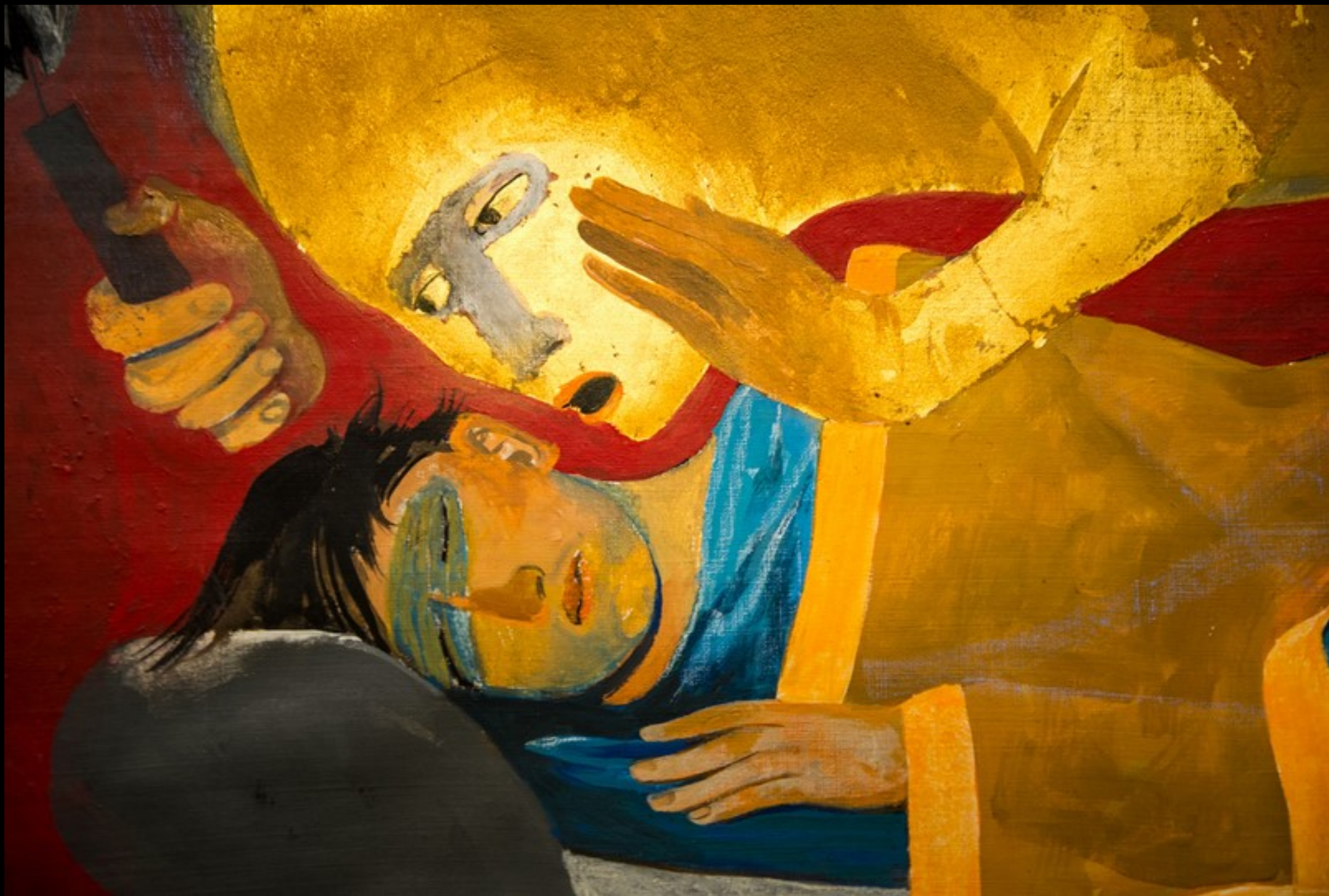
The Angel of the Lord Speaks to Joseph in a Dream